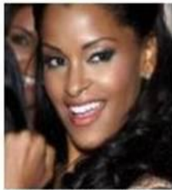
Blacks Racially Profiling other Blacks: Why Did Claudia Jordan Feel She was Racially Profiled?