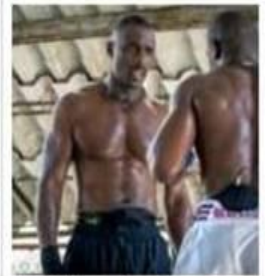
Idris Elba Trains for 'Fighter'