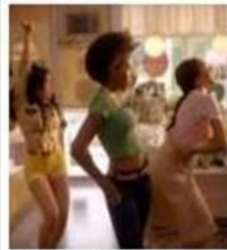
Netflix's Original New Series 'The Get Down' Authentic or Nah?