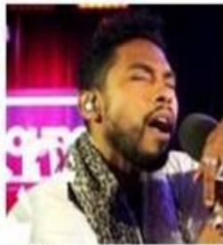
Live Performance, Miguel Sings 'Coffee' Live in the 1Xtra Live Lounge