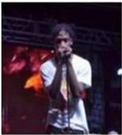
Rihanna and Travi$ Scott Collaboration for her eighth Studio Album